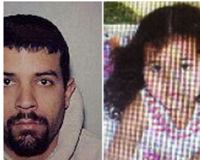
9-Year-Old Found Safe In Rhode Island