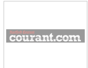
TBL: How Much Does Permanent, Standby Generator Cost?