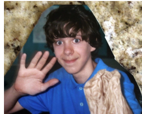
Adam Lanza: A 'Quiet, Odd' Loner Living On The Fringes