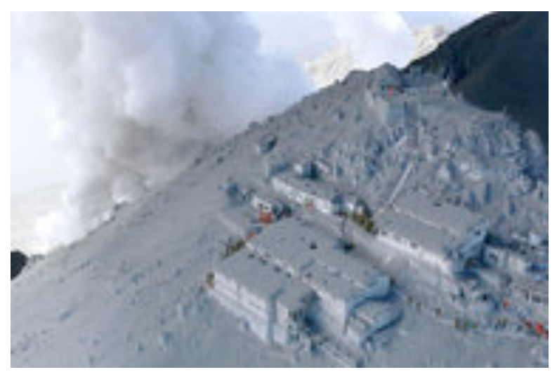
Dozens of Hikers Apparently Dead Near Peak of Erupted Volcano in Japan

For Many New Medicaid Enrollees, Care Is Hard to Find, Report Says