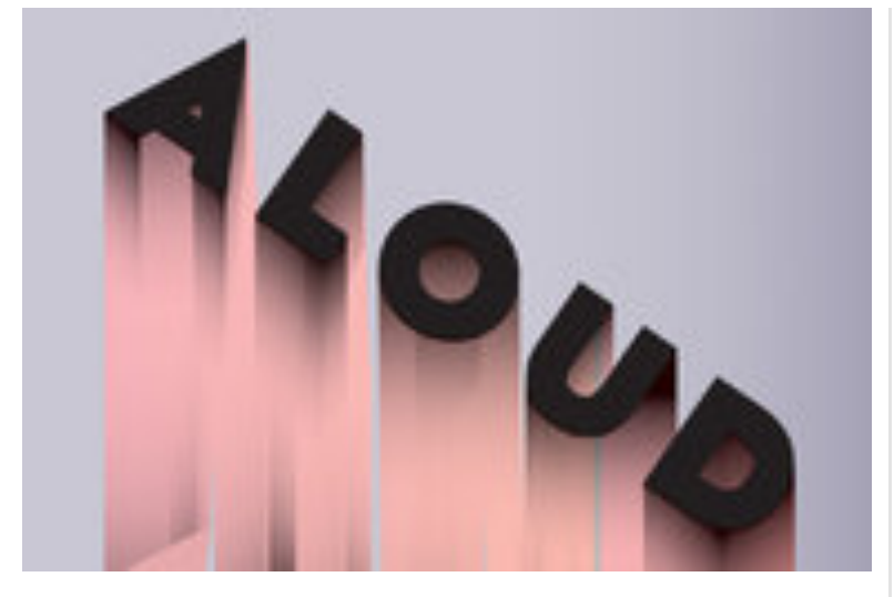
OPINION Learning to Love Criticism