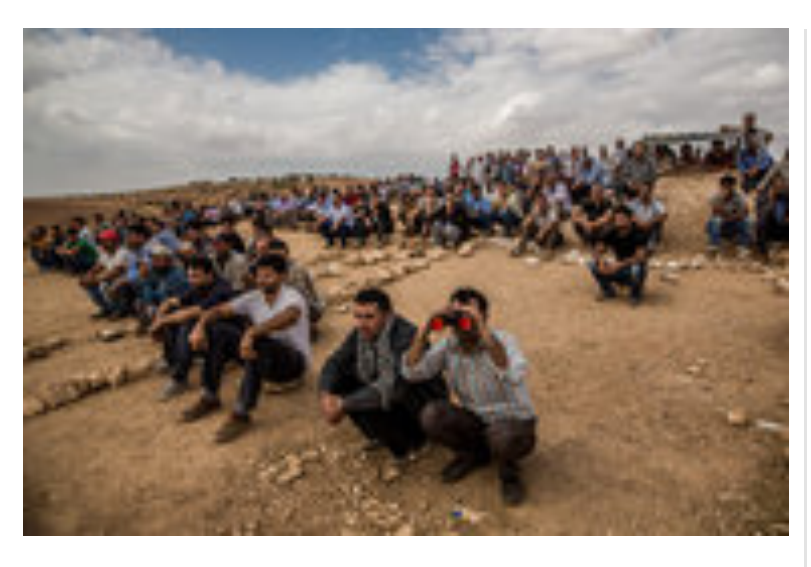
Turkey Inching Toward Alliance With U.S. in Syria Conflict