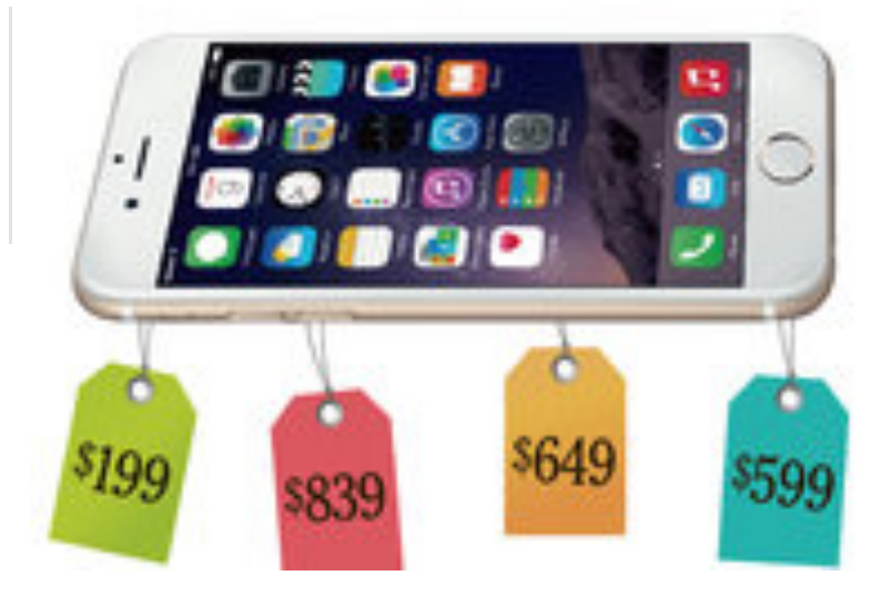
$199 Apple iPhone 6 Is Fiction, if Not Fantasy

For Many New Medicaid Enrollees, Care Is Hard to Find, Report Says