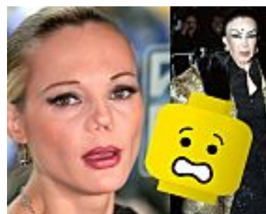
The Most Dramatic Facial Changes! Lossip