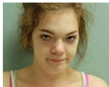
Heartbreaking: 6-Year-Old Found Hungry, Wandering in Pittsburgh... Latest.com