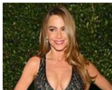
The Most Beautiful Celebrity Women over the age of 50 She Budgets