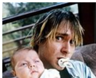
Children of Dead Celebrities: Where Are They Now? Ranker