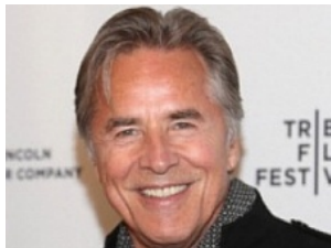
These 15 once-rich people had it all, and then lost it all.