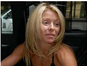
15 Surprising Pictures of Celebrities Without Makeup