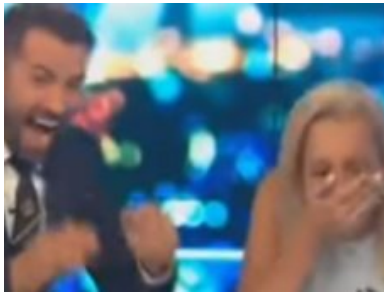
Carrie Bickmore's on-air slip is the breast thing we've seen all week.