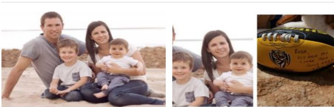
Father who drove his two young sons into ocean...

Many victims may ask why I would want to put myself through that. It is a question I have often asked myself. What have I personally got out of telling my story? For years I took the road of silence thinking that was the easier road to take. Silence, secrecy and shame are the child's worst enemies and the paedophile's best friends.