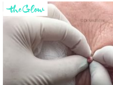
Dr Pimple Popper just squeezed the biggest...