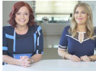
'I want my vagina to be the cleanest in the country.'