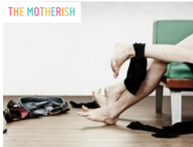
"I had a baby – and my sex life has never been better."