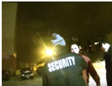
Bouncer wears a GoPro on New Year's Eve. Proves...